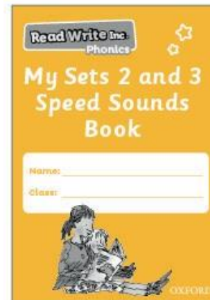
Practise reading and writing sounds in My Sets 2 and 3 Speed Sounds Book .

Ask your child to flick through the book and read the sounds as quickly as he or she can. If your child hesitates reading a sound, the picture is on the back as a reminder. Your child can also practise writing the sound on the same page.