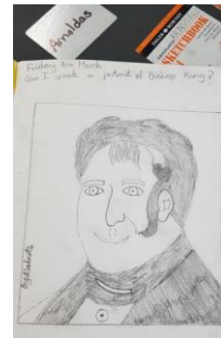
Bishop King Day