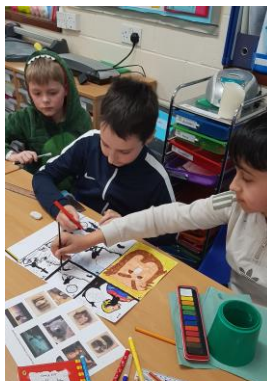
World Book Day Celebrations