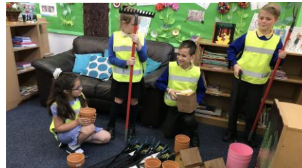
Wilko interviewed and filmed our Eco Council, together with gardening equipment bought from our 'Great British School Clean' prize vouchers.