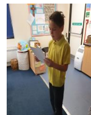
Sacred Space project