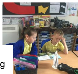
Children enjoying reading