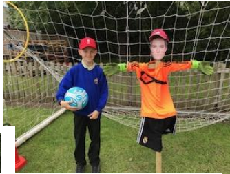
Fun at the Summer Fair!